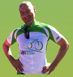
Global Biking Initiative

Secure your spot for an unforgettable Transalp experi-